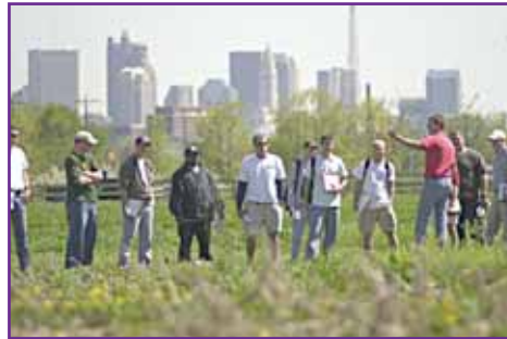
Students learn about farming practices during a lab held at the Waterman Farm on the campus of The Ohio State University. The city of Columbus is visible in the background.