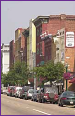
Ohio NEMO provides new and diverse water quality programs to communities throughout the state.

This positive collaboration has opened even more opportunities between NEMO and OSU Extension in water quality education. Ohio NEMO is now working with one of the major developers in Central Ohio and introducing them to the OSU Urban Landscape Ecology Program, which works to develop environmentally sound technologies and approaches to landscape planning, establishment, and maintenance. Next year, the 30 faculty members of the Urban Landscape program, the Franklin County Extension office (who will work with the homeowners association to continue the program) and Ohio NEMO will work with the developer to develop an Eco-Friendly (or NEMOesque) neighborhood. Without the trust developed through the Ohio NEMO and NEMO