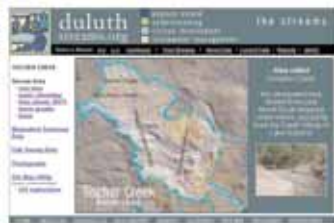
Screen capture from the unbelievably useful and just plain snazzy website duluthstreams.org .

This information lets us directly link land use to water quality, displays the impacts of local land use on our streams, is critical to showing that the problem is occurring here and now and really gives the imperious/land use story some teeth. Unfortu-