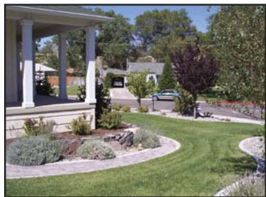
A landscaper in Nevada modified his practices to address excessive irrigation water use after attending a NEMO training.

gram; the most successful towns have internalized NEMO to a great degree.