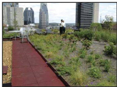
A green roof demonstration project in downtown Nashville, Tennessee.

Question 5: We’d like to get a break-down of the cost of starting a NEMO Program.