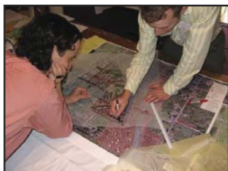
Northland NEMO hosted a planning charrette to create a plan of development for a 100 acre site.

watershed group, land trust, etc.); the dollar amount of the time of these volunteers has not been estimated, but is considerable.