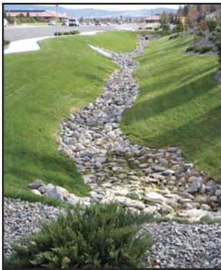
The city of Reno, Nevada is encouraging LID practices, such as this grass swale, to be used in all new development.

Some questions along these lines include: