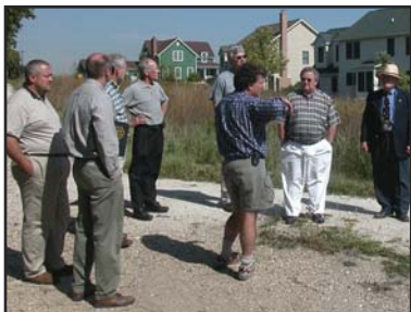
IN NEMO is helping communities form local committees to address natural resource issues in land use planning.