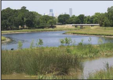
A constructed wetland along the Brays Bayou in Houston, Texas.