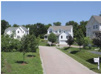
Individual homes at Jordan Cove have pervious driveway materials, rain gardens handling roof runoff, and “no mow” zones in the back yards featuring native vegetation. A sunken, vegetated cul-de-sac center accepts and treats runoff and there are swales located on each side of the street.

Data layers that are needed for basic NEMO, including the impervious surface build-out analysis, are detailed in our Technical Paper 4: “Do It Yourself,” available in hard copy and posted on our Publications section of the NEMO website.