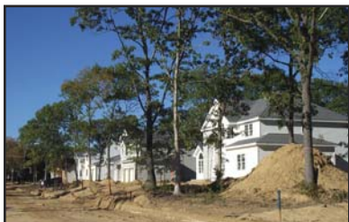
New York NEMO recommendations are changing how runoff is addressed in new developments.

The next chunk of funding is for the cost of conducting educational programs. Since NEMO can provide much of the foundation educational materials, the costs mostly involve printing, program delivery (laptop and computer projector or slide projector) and travel (which can vary widely depending on the geographic scope). We are great fans of the qualitative improvement that computer projected presentations (e.g., PowerPoint™, Keynote) make; however, a decent laptop and projection system may run you $5,000 - $8,000 (but getting cheaper and better all the time!). So, say maybe $10,000 as an average figure for this whole category, including the projector system.