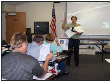
Local officials in Nevada show an average 20 percent increase in their knowledge of land use impacts to water quality after attending NV NEMO training.

Costs for data acquisition and GIS services vary widely. They can be expensive if “shopped out,” but most NEMO adaptations to date are using in-kind services from state or regional agencies to provide them, at little or no cost to the project (and providing some of that match that we talked about in Question 1). In general, the data is there for basic NEMO educational applications. Data for more intense analyses (like our Eightmile River Watershed project) may have to be generated, or at least collected from multiple sources. So, the costs of this part of the budget page could be from zilch to maybe $25,000.