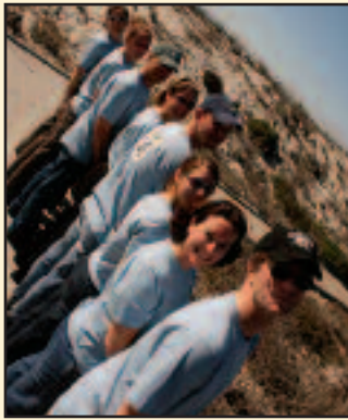
The NEMO Hub and CT NEMO team pose for a group photo at NEMO U6 in Monterey, California.

As the Network has grown, the Hub's primary role has shifted from helping programs get started to facilitating communication and resource sharing between programs. The Hub manages a Network listserv and has created a "members only" website for the sharing of presentations, publications and other resources amongst programs. The Network also gathers every eighteen months to two years at NEMO University (NEMO U), the national conference of the Network. NEMO U is a seminal event in the growth and development of the Network, providing an opportunity for folks to forge connections across the country and learn from one another.