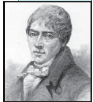
Entrepreneur, engineer, and devoted royalist, John Loudon McAdam

To learn more about the Municipal Initiative and other Connecticut projects go to NEMO's website: nemo.uconn.edu