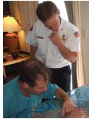
SC NEMO is helping coastal communities identify and protect critical natural resources.

▶ Bluffton, South Carolina: SC NEMO provided technical and financial support to the Town of Bluffton, located outside of Hilton Head, to develop a critical resources survey and map . The survey is being used to identify threats to critical natural resources, and serve as the basis for natural resource protection