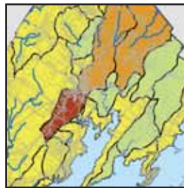
An analysis on impervious surfaces in Freeport, Maine.

coverage compared to projected conditions for the Town of Freeport. The results spurred the town to revise their comprehensive plan and zoning to significantly limit the amount of impervious surfaces at fully built-out conditions.