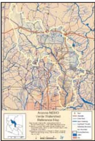
AZ NEMO utilizes GIS mapping and watershed assessments to help communities develop watershed-based plans.

► Osceola, Wisconsin: The Northland NEMO Program worked with the City of Osceola to complete a stormwater study focused on protecting a designated trout stream in the area. As a result of the NEMO