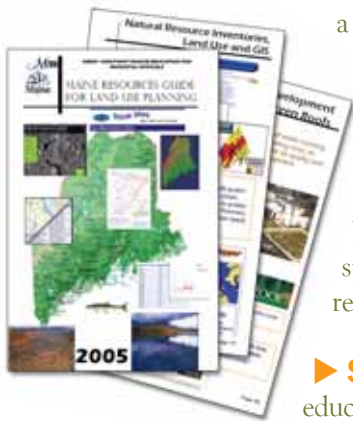
ME NEMO's resource guide for local land use decision makers.