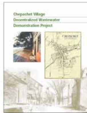
RI NEMO helped Glocester develop a plan for wastewater treatment.

▶ Glocester, Rhode Island: In partnership with the University of Rhode Island’s (URI) Onsite Wastewater Training Center, RI NEMO worked with the Town of Glocester on the Chepachet Village Decentralized