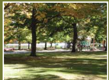
Bryan County, Georgia formed a citizen advisory group to help identify land protection priorities and incorporate them into the County's Open Space Plan.

planners, local governments, assessors, appraisers and others in Glynn County. The county set land protection priorities and developed an open space decision matrix to help guide the focus on priority parcels. County funds were used to purchase several properties for open space protection, including 65 acres along the Altamaha River and 13 acres on St. Simons Island. The County is also working with the St. Simons Land Trust to permanently preserve county park lands and sub-division open space set-asides.