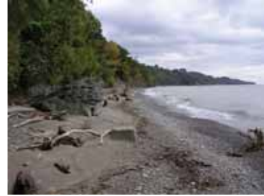
Erie County, Pennsylvania and its partners purchased the development rights of a 39 acre tract of waterfront for conservation.

▶ Erie County, Pennsylvania: The PA NEMO Program worked with the County of Erie, the Lake Erie Region Conservancy, the Pennsylvania Department of Conservation and Natural Resources,