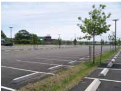
RI NEMO helped convince the University of Rhode Island to install two porous pavement parking lots.

Changes in procedures, plans and regulations result in on-the-ground changes to the way a community alters (or does not alter) its landscape. As noted in the beginning of this report, NEMO's emphasis on natural resource based planning gives rise to a wide range of local actions covering both the conservation and development sides of community growth. On the ground, these can range from permanent protection of open space to more environmentally sustainable development design.