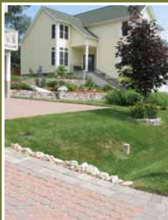
Individual homes at Jordan Cove have pervious driveway materials, rain gardens handling roof runoff and “no mow” zones in the back yards featuring native vegetation.

In 2006, the NEMO Team will be creating a multimedia CD and website devoted to “telling the story” of this unique project.