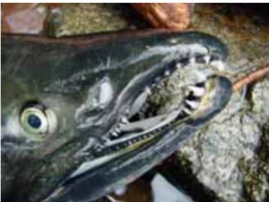
WA NEMO helped Kitsap County identify key salmon habitat and wildlife corridors.

corridors and areas worthy of protection from development. When a local timber company put two parcels of land within those areas on the auction block, Kitsap County was able to identify the more valuable parcel, in terms of wildlife corridor, salmon habitat protection and continuity with other protected lands, and to mobilize over 1 million dollars within a month to purchase the land.