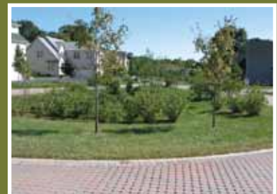
Sunken, vegetated cul-de-sac center accepts and treats runoff.