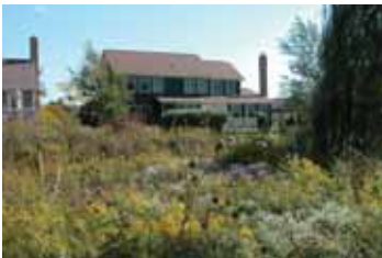
Porter County, Indiana adopted a conservation design subdivision ordinance to preserve open space.

► Porter County, Indiana: The Indiana NEMO effort, Planning with POWER , has helped Porter and Lake Counties, which lie outside of Chicago along Lake Michigan, launch a joint Smart Growth initiative. The initiative was spurred by the region’s tremendous growth, rapid loss of farmland and POWER’s participation in the Open Space Planning Boot Camp (page 30). As part of this effort, Porter County recently adopted conservation design