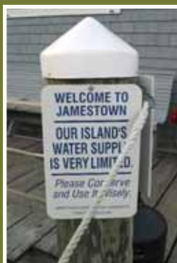
RI NEMO is helping the island community of Jamestown protect their water resources.

that have substandard lots served by private wells. Provisions of the ordinance include an impervious surface limit of 15% (calculated for individual lots and excluding wetlands), a requirement to control runoff volume using low-impact techniques to maintain pre-development infiltration for a 25-year storm and mandated use of advanced wastewater treatment technologies capable of 50% nitrogen removal.