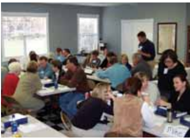
AL NEMO is helping communities along Mobile Bay work together to protect the bay.

► Houston, Texas: TX NEMO worked with the City of Houston to correct landscaping ordinances that make it difficult to use native plants in commercial landscapes. A variance was obtained for a “watersmart” demonstration landscape on a high-profile city-county project. The fact that a variance was necessary drew attention to problems with the ordinance. TX NEMO is continuing to work with the city on the lengthy process to change the ordinance.