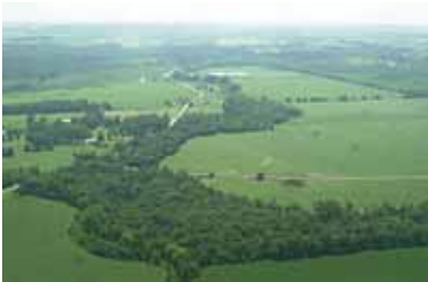
OH NEMO is working with communities in the Big Darby Creek watershed.

of Columbus adopted special zoning overlay ordinances for lands along a major tributary of the Big Darby Creek, the Hellbranch. The ordinances create buffer zones, reduction in impervious surface and increased infiltration requirements. Much of the information from the Darby overlay has been used in the development of a draft citywide ordinance, with further input from OH NEMO.