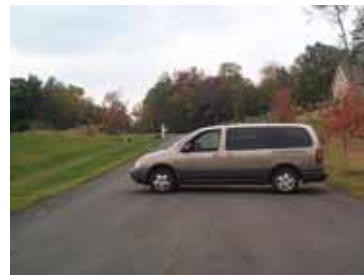
Communities like East Haddam, Connecticut are adopting new subdivision regulations that allow for narrower roads.

► Trussville, Alabama: The AL NEMO Program has been working with the City of Trussville to protect the picturesque Cahaba River, the last remaining free-running river contained within Alabama. As a result, the city has passed a Cahaba River Overlay District , which creates a 125 foot buffer along the river. The district is divided into three sections, with land use restrictions progressively increasing with proximity to the river.