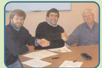
Memorandum of Understanding signing ceremony between NEMO and the Center for Watershed Protection.