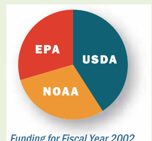
Funding for Fiscal Year 2002 totalled $190,000.