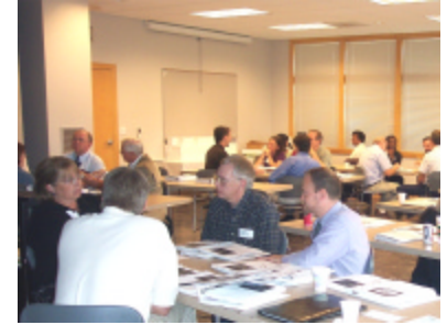
Memphis-area planners and public works officials work together in a TGR workshop. They are developing a proposal for the County Mayor to reduce growth's impact on water resources.

Tennessee Growth Readiness workshops and technical assistance considered as a whole supports communities' logical progress toward